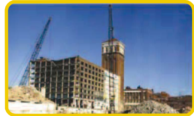
Sears Warehouse Construction Site