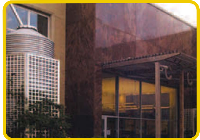
CCGT Site After