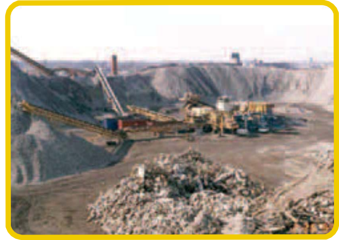
CCGT Site Before

A 35,000 square foot, single story warehouse on the Searle campus was removed to accommodate construction of a new chemistry lab. Materials removed and recycled as part of the dismantlement included about 1.1 million pounds of metal and 1.4 million pounds of solid fill materials (brick, concrete, etc.). The estimated overall recycling rate was 72%, yielding a net savings of approximately $53,000.