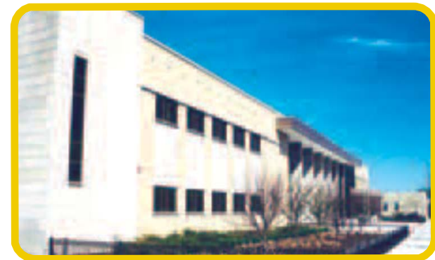
22nd District Police Station