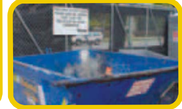
Ford Motor Engineering Center Construction Site