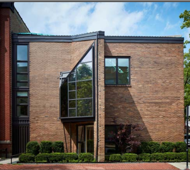
Walter Netsch (1974)