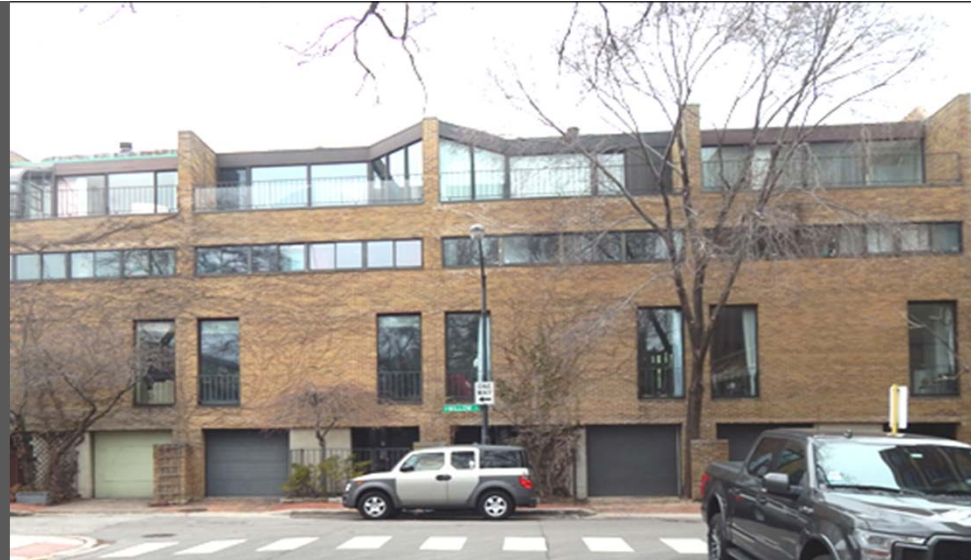
Harry Weese and Associates (1973)