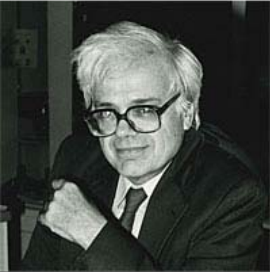
Benjamin Horace Weese, F.A.I.A.