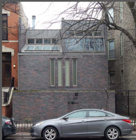
Stanley Tigerman (1970)