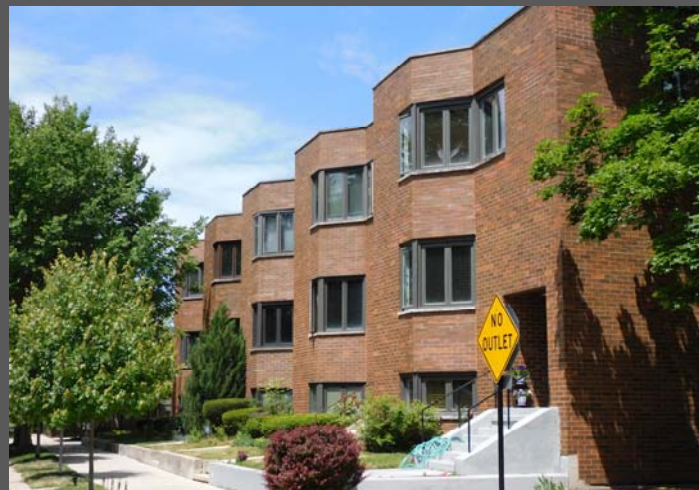
Greenwood Park Townhouses in Kenwood (1971)