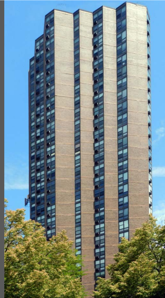
Lake Village East in Kenwood (1973)