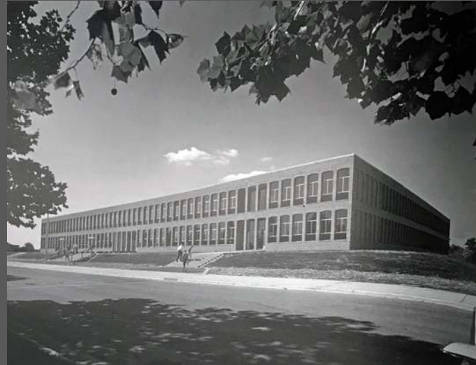
Northside Junior High School, Columbus, IN (1961)