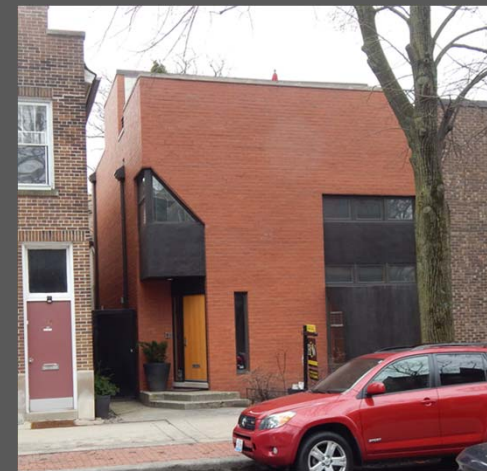
Bauhs & Dring (1977)