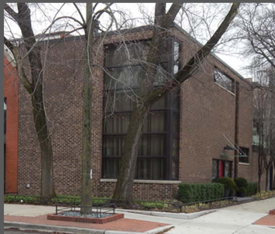
Booth, Nagle & Hartray (1977)