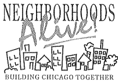
Christine Raguso Acting Commissioner