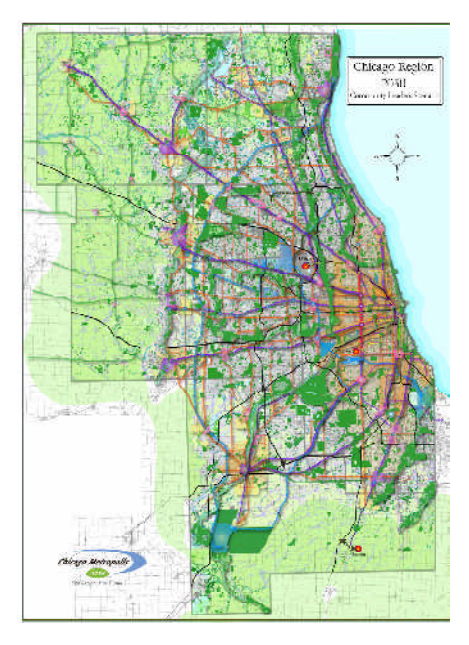
Figure 1.6 The Metropolis Plan for the region says, "a strong Chicago downtown is essential to our region's future."

The City of Chicago will continue to work with Metropolis 2020, NIPC and other regional partners to implement our common vision.