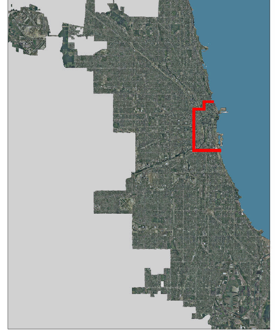
Figure 1.4 The Central Area makes up 2% of the City of Chicago. It is the hub for public transit and the region's expressways.