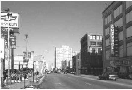
Figure 1.1 South Michigan Avenue today