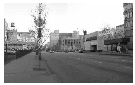
Figure 4.3.51 Michigan Avenue today.