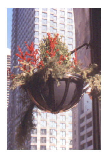
Figure 4.3.47 Hanging planters add greenery and keep sidewalks open