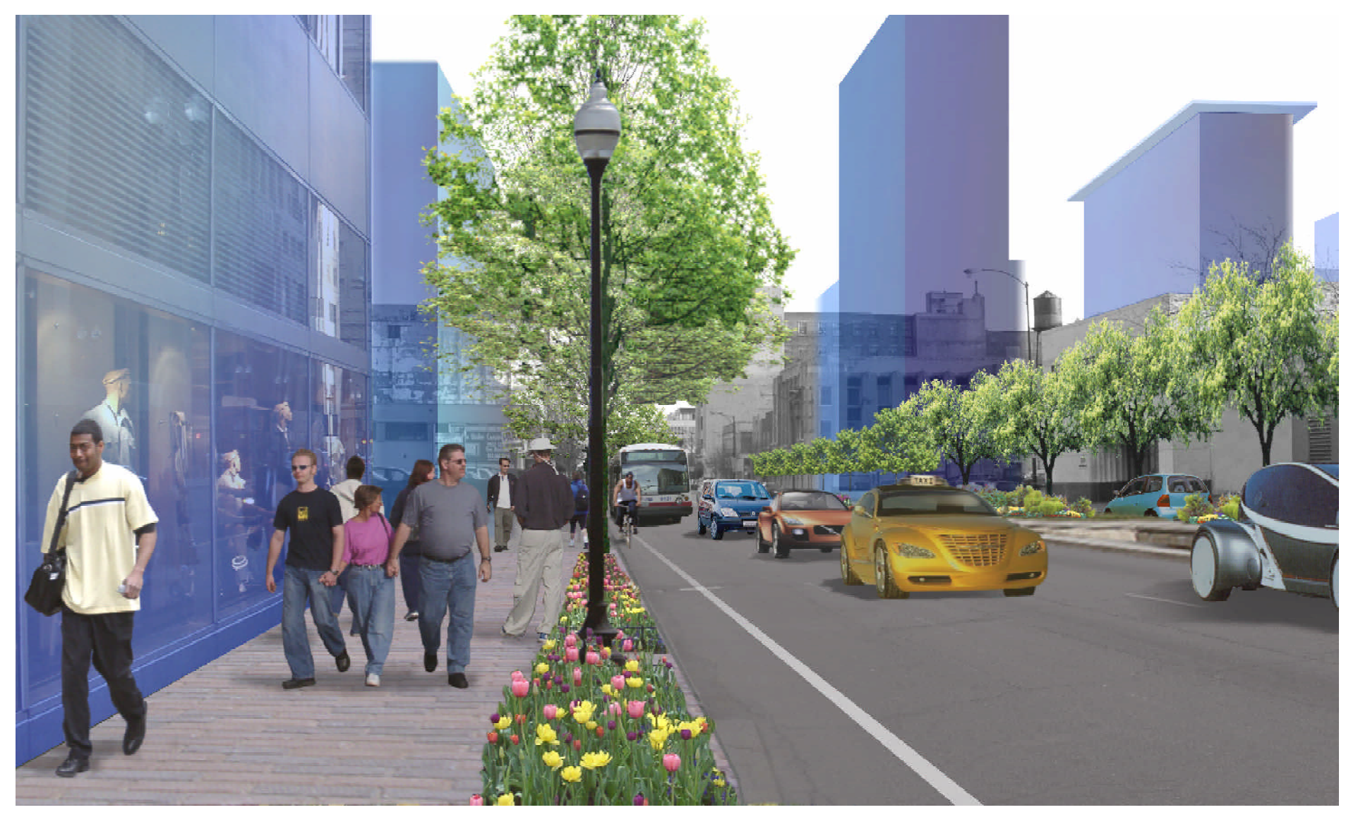
Figure 4.3.50 Michigan Avenue, looking south from Roosevelt Road, in 2020. South Michigan Avenue will be a landscaped street connecting the Near South district to the Loop. It will be a major pedestrian, bicycle and transit corridor.