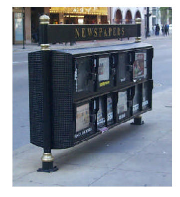
Figure 4.3.48 Randolph Street Consolidated newspaper rack