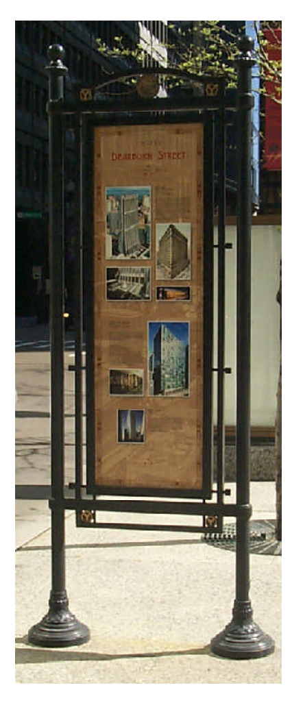
Figure 4.3.49 Street signage explains local points of interest