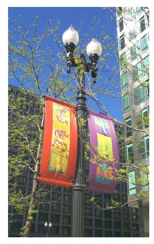
Figure 4.3.46 Dearborn Street Lights and landscaping in the Loop